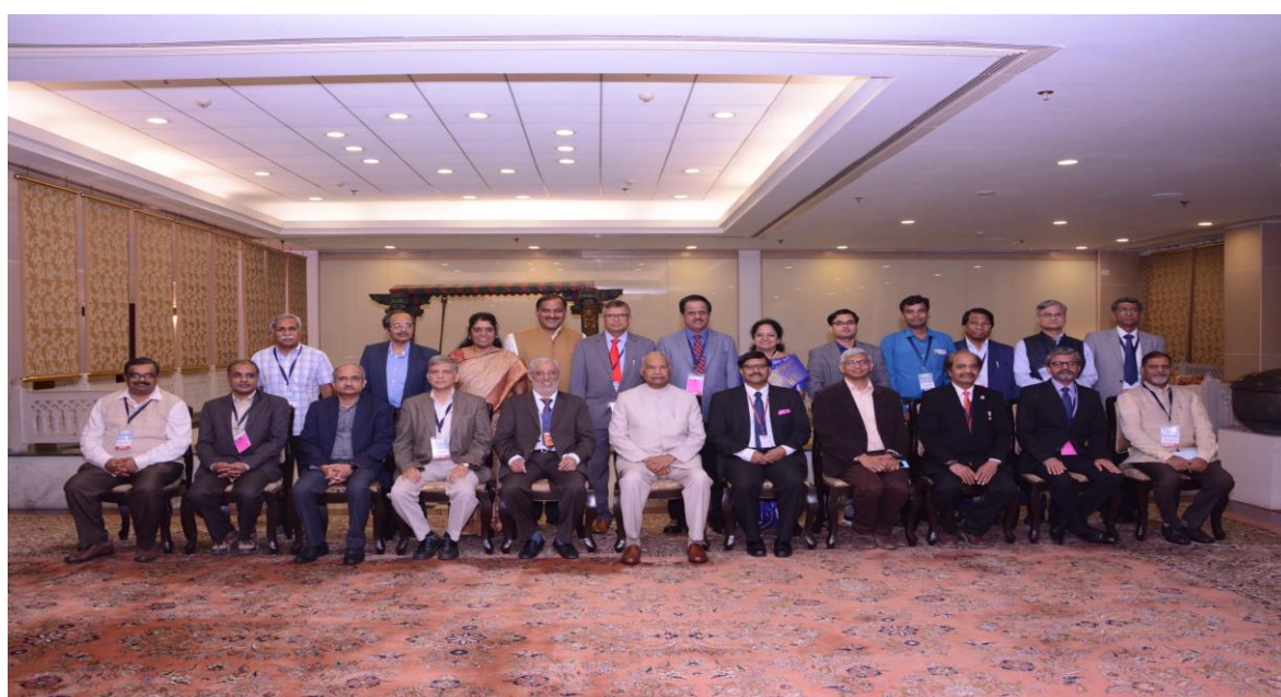
Group Photo: Hon'ble President of India with ARIIA 2019 Awardee Institutions and ARIIA Core Team